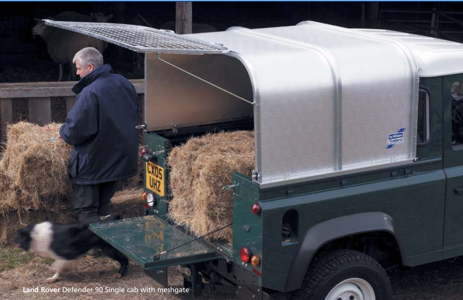
Land Rover Defender 90 Single cab with meshgate

So that we can offer increased flexibility to our customers, each canopy model is offered with a rear meshgate, aluminium door with window or an aluminium door without a window.