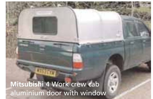
Mitsubishi 4 Work crew cab aluminium door with window

We offer an extensive range of pick-up canopies for popular models from leading manufacturers. Your local Ifor Williams distributor can advise you on your canopy selection.