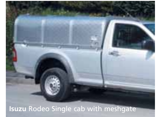
Isuzu Rodeo Single cab with meshgate

Ifor Williams Canopies are strong, tough, built to last and are exceptional value for money. That's why thousands of pick-up owners buy our canopies every year.