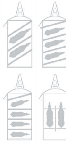
Typical partition layouts of HB510XL