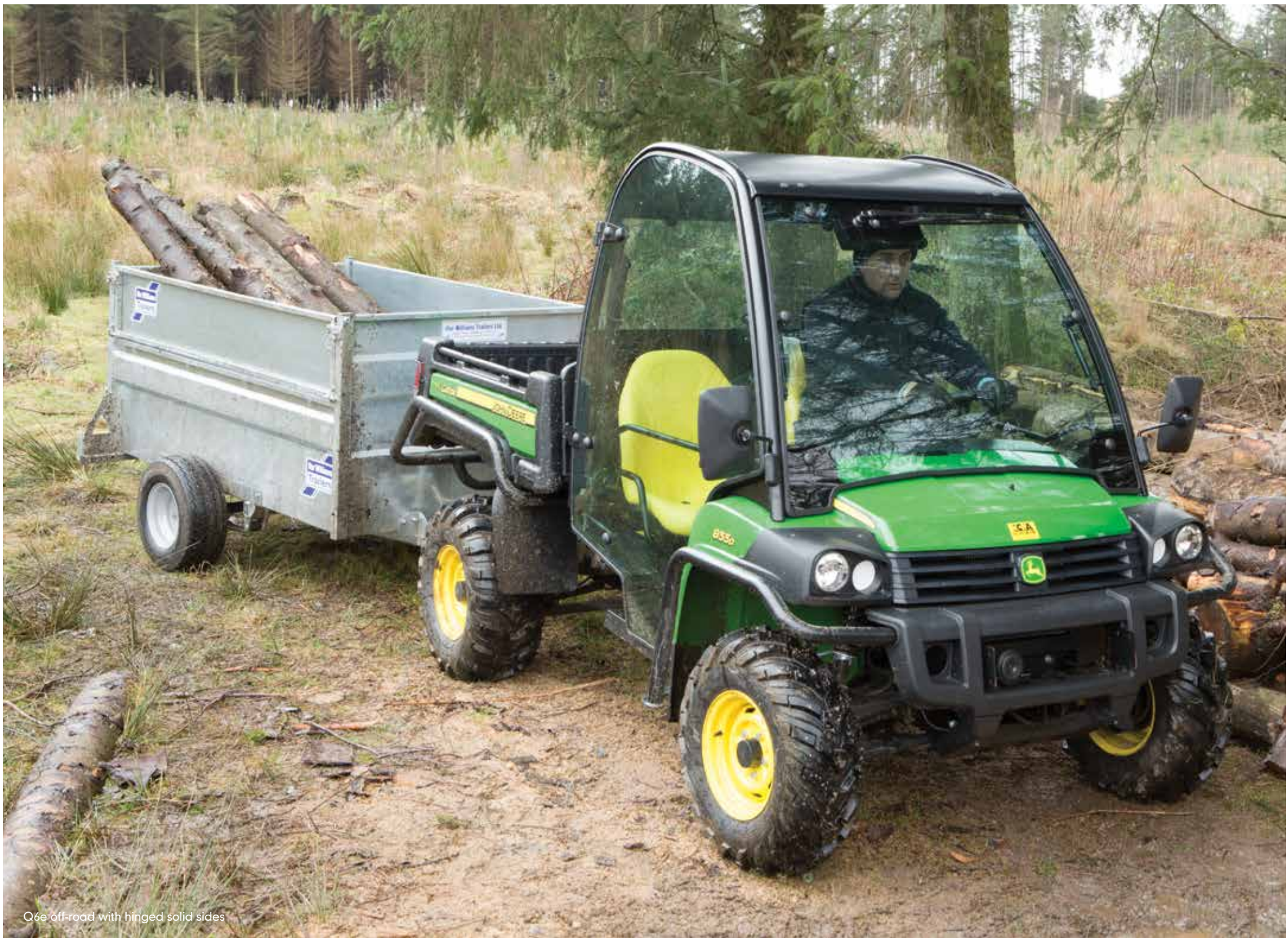
Q6e off-road with hinged solid sides