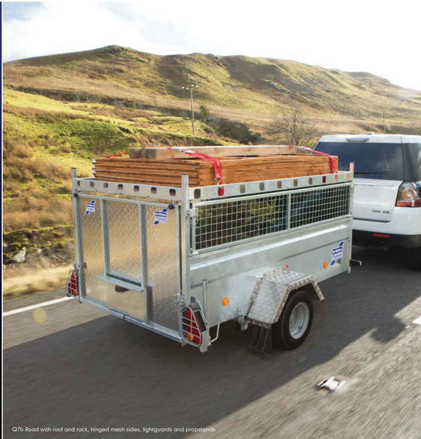
Q7b Road with roof and rack, hinged mesh sides, lightguards and propstands

We are an independent company with one focus: to build the best products on the market. More than 30,000 people choose our trailers each year – but we are not standing still. Our dedicated investment in new technologies and materials ensures that our products continue to exceed the expectations of our customers. We know that quality, strength, value and ease of maintenance are of vital importance to you. That is why we have made them the driving force behind everything we do.