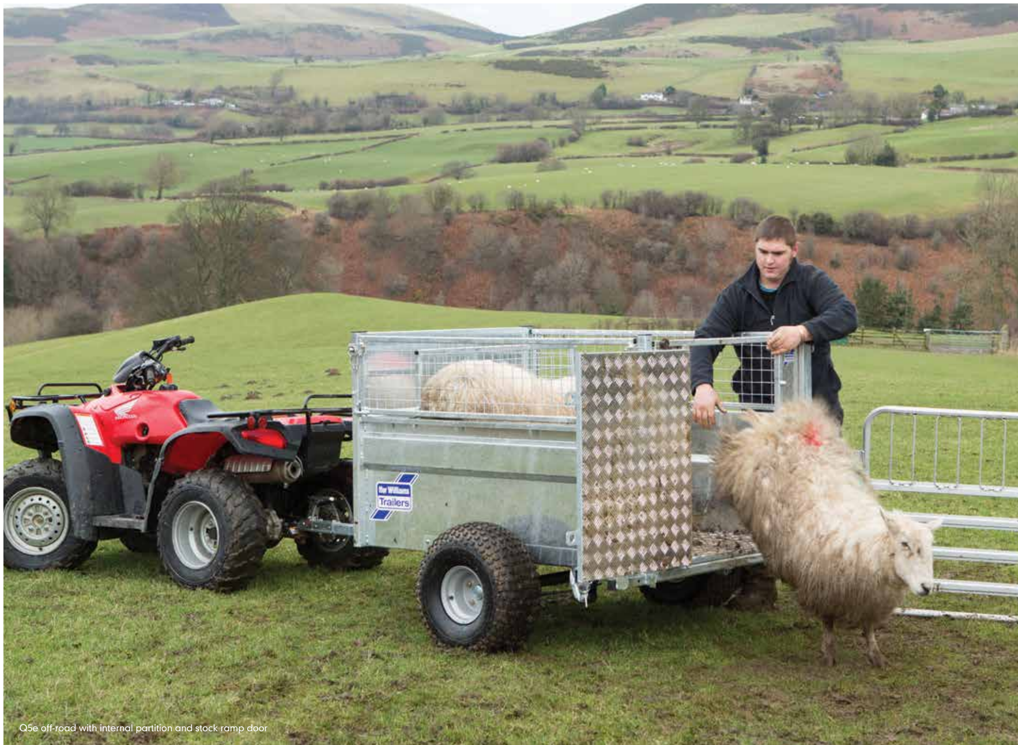
Q5e off-road with internal partition and stock ramp door