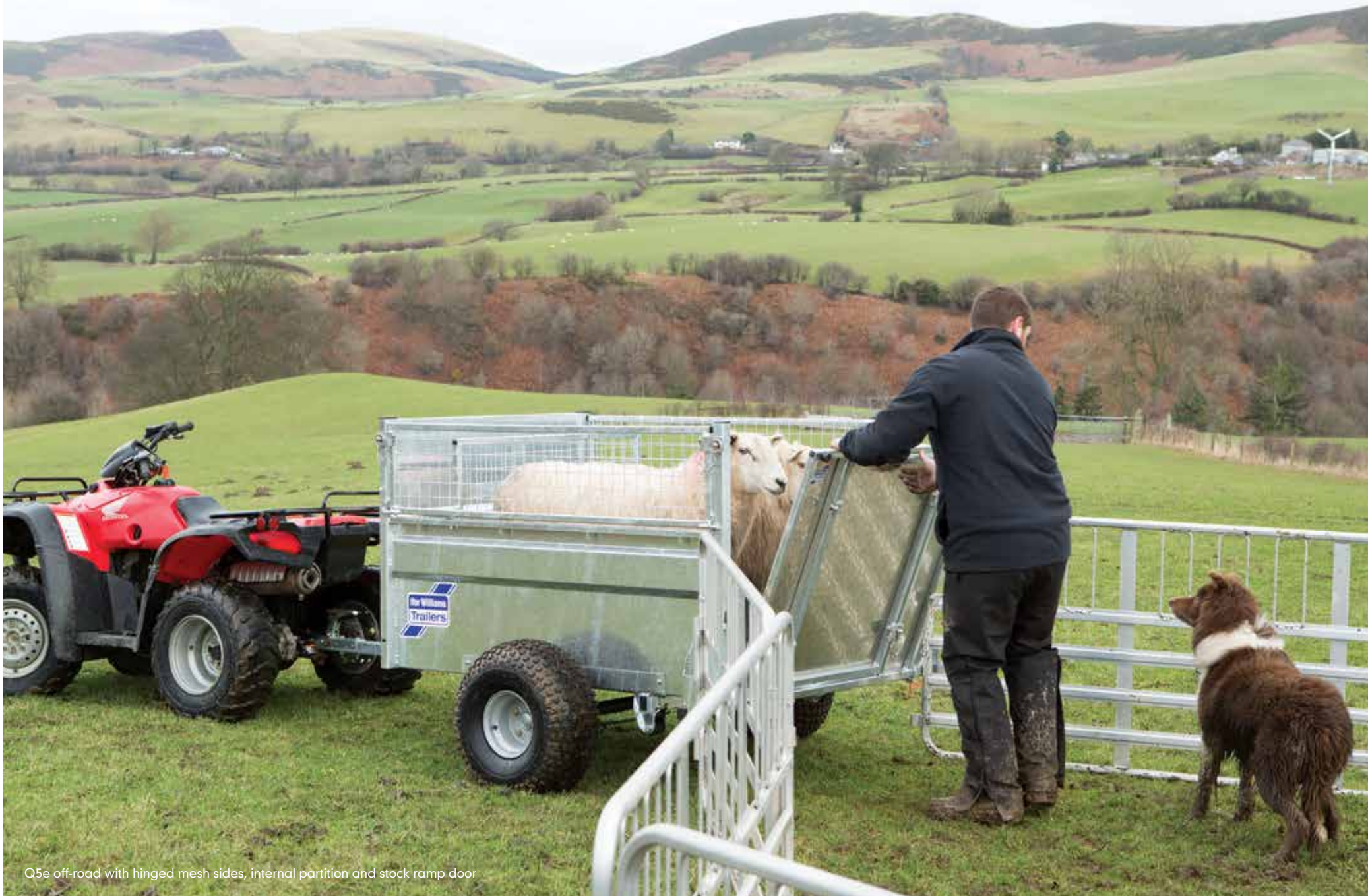
Q5e off-road with hinged mesh sides, internal partition and stock ramp door