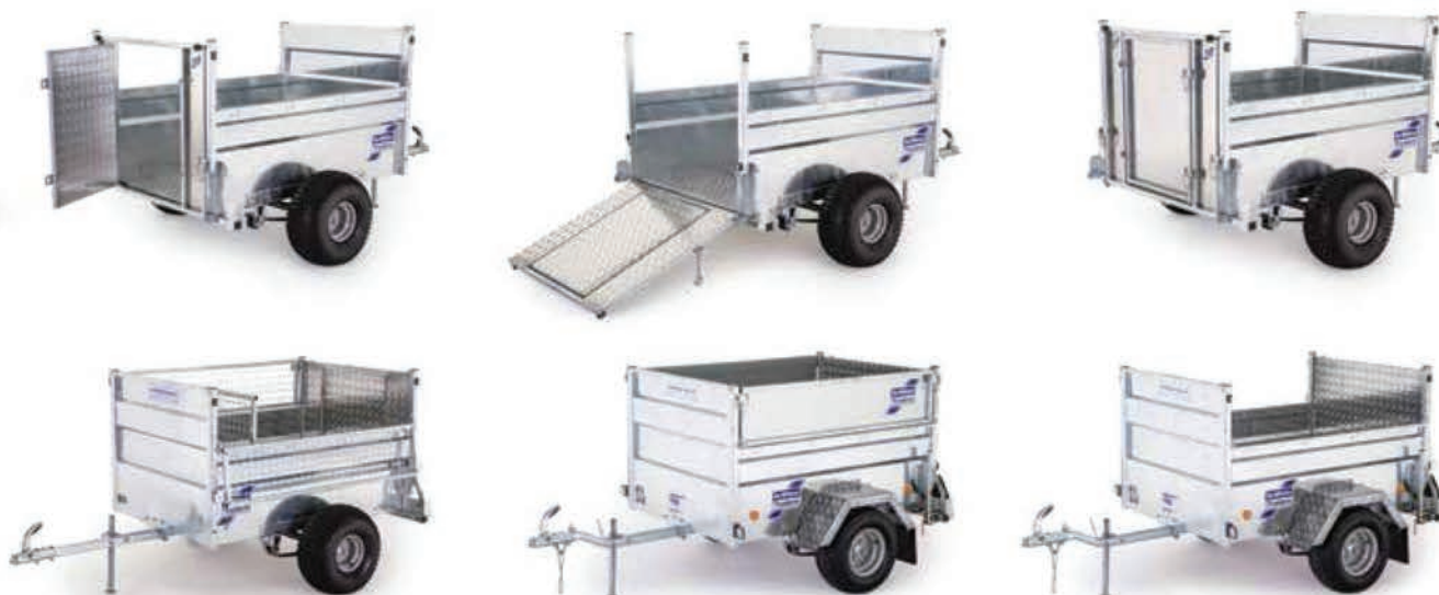
Q5 Q5e off-road and road versions showing different ramp, hinged sides and internal partition options