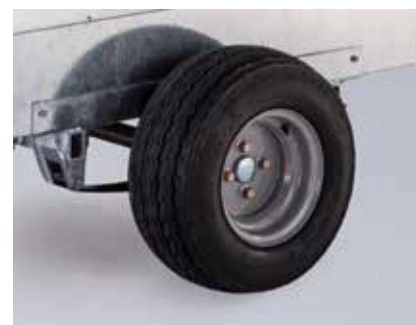
Q5/6/7e off-road flotation tyres (20.5 x 8-10)