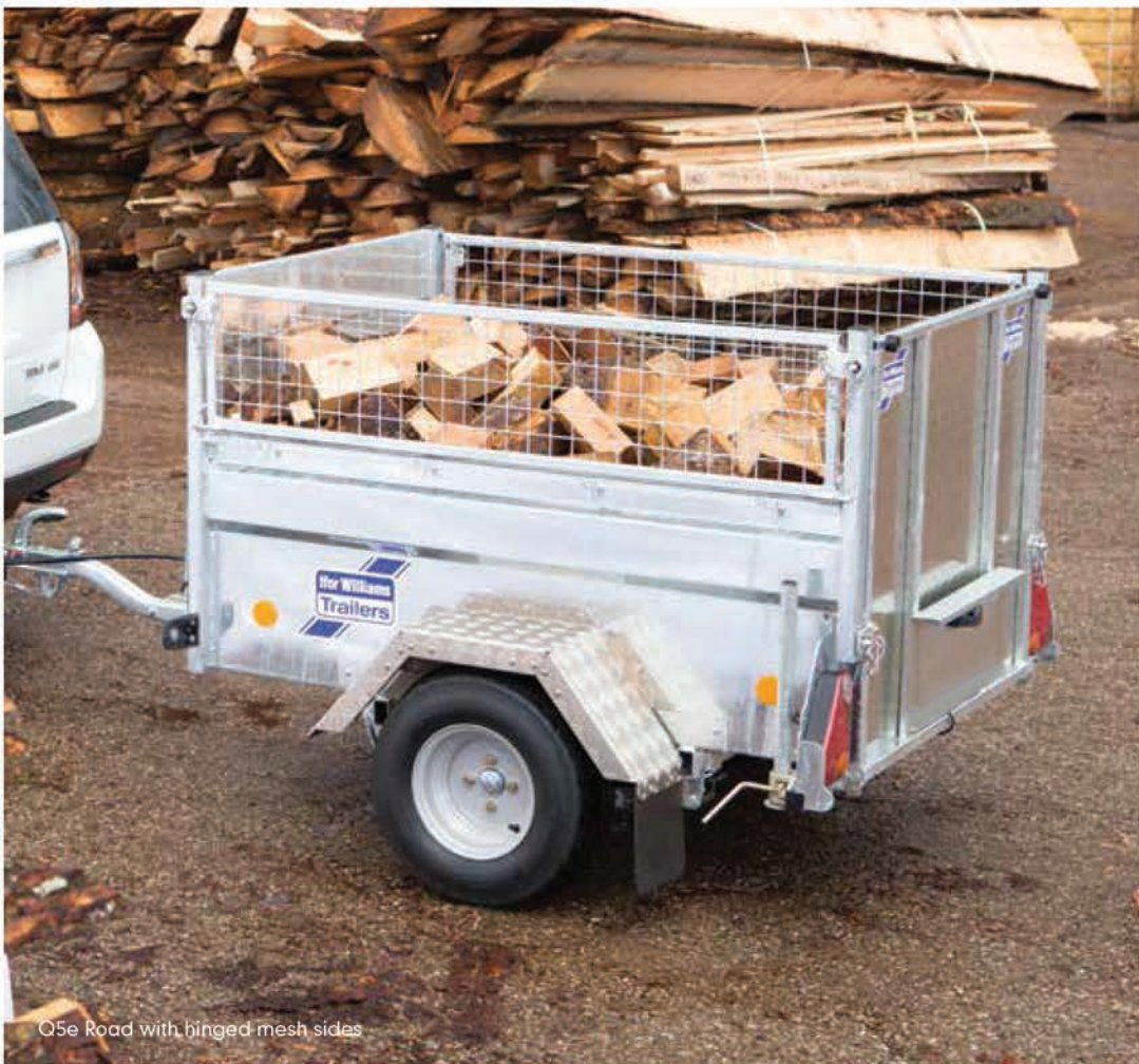
Q5e Road with hinged mesh sides