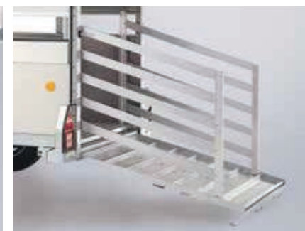
Optional ramp gates available on Q6, 7 and 8