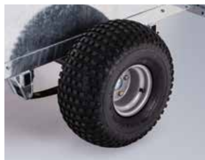
Q5e off-road knobby tyres (22 x 11-8)