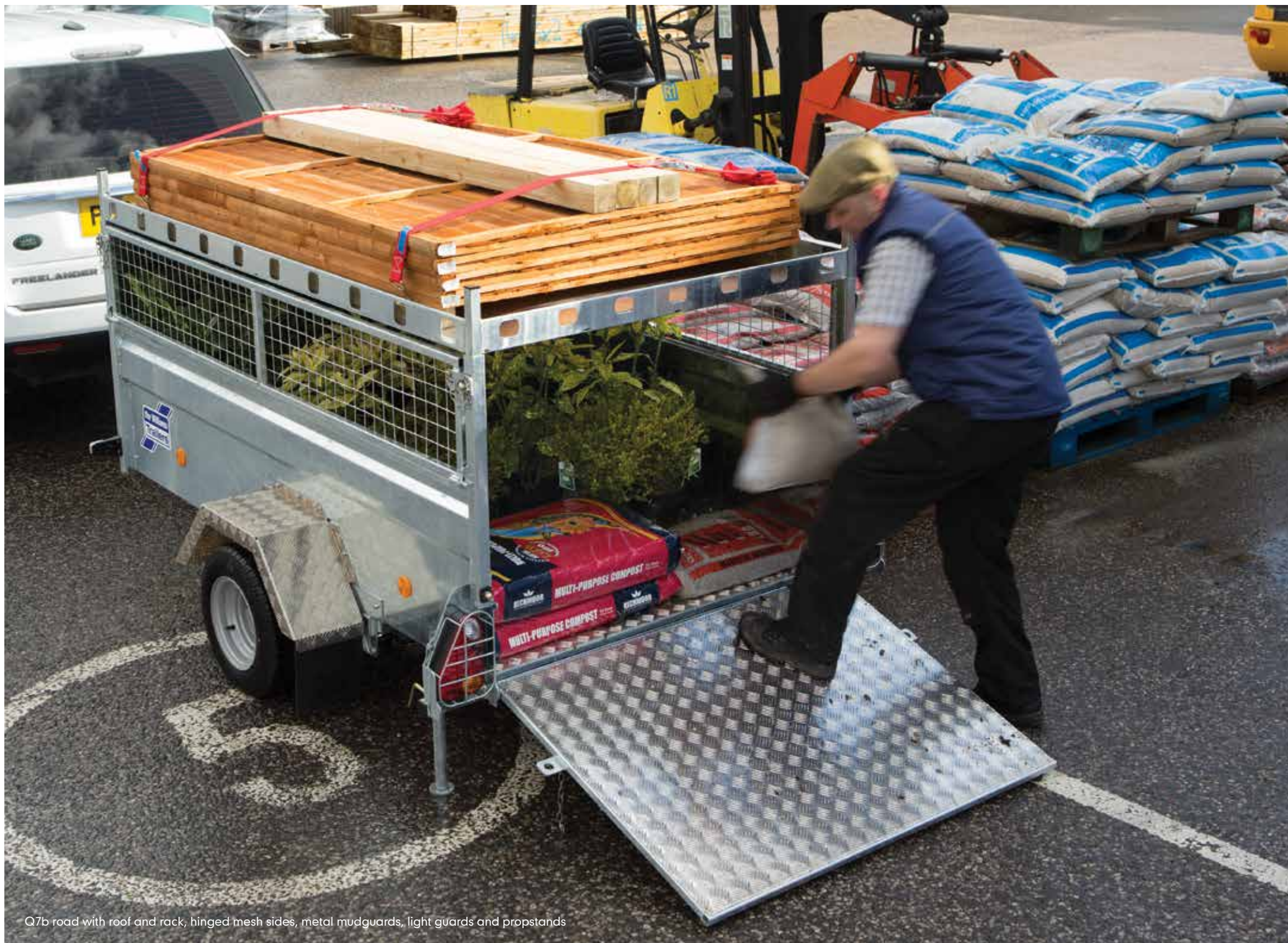
Q7b road with roof and rack, hinged mesh sides, metal mudguards, light guards and propstands