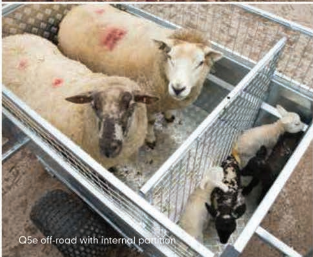
Q5e off-road with internal partition

The option of an internal partition easily positioned at different points allows lambs on one side and ewes the other – safer transport for all animals.