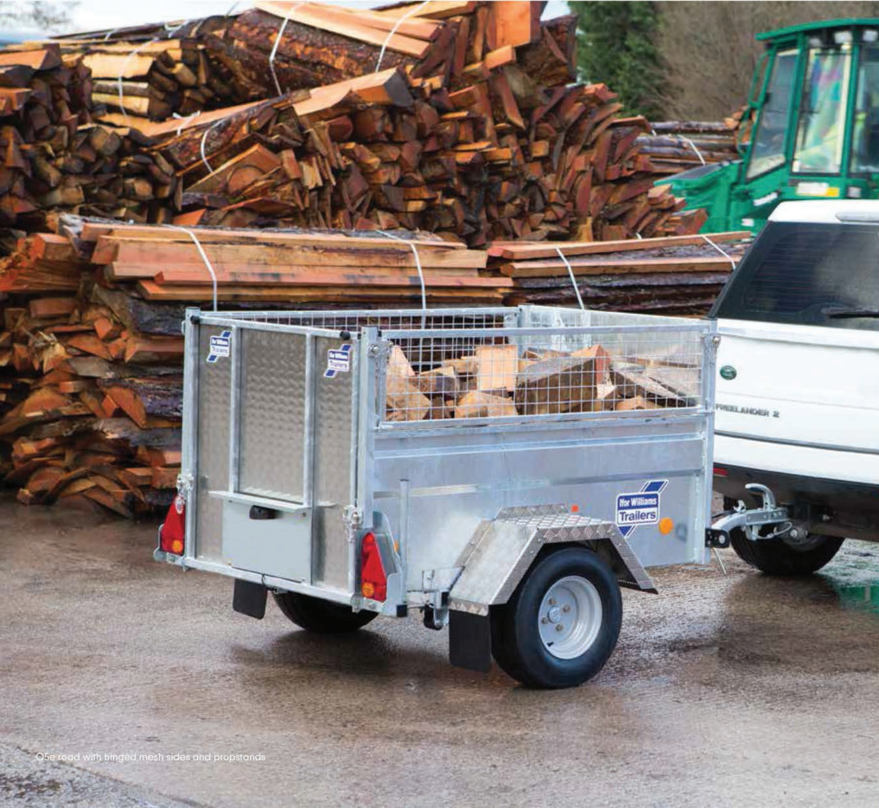
Q5e road with hinged mesh sides and propstands