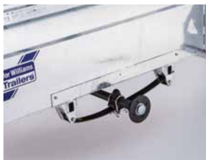
Leaf spring suspension is standard