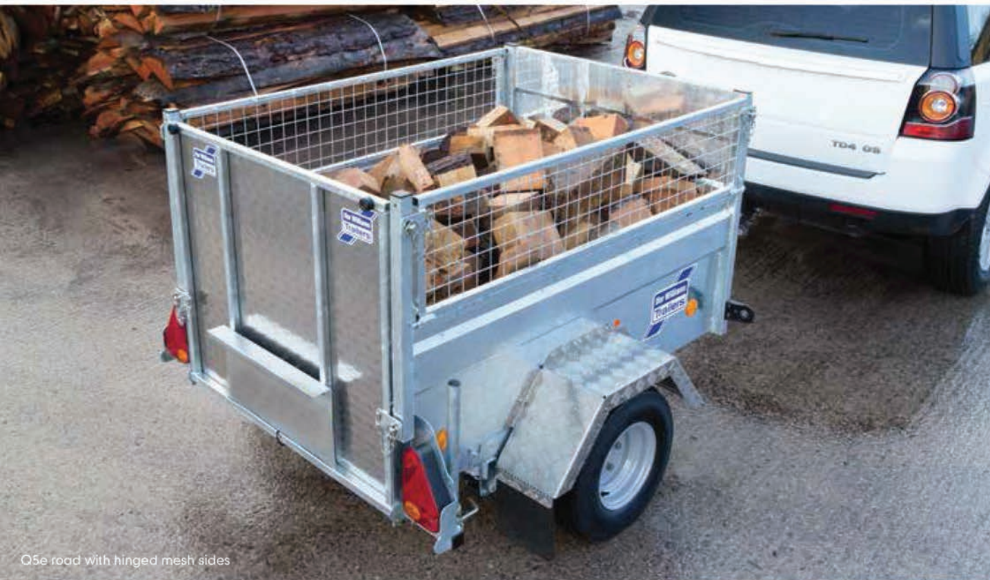
Q5e road with hinged mesh sides