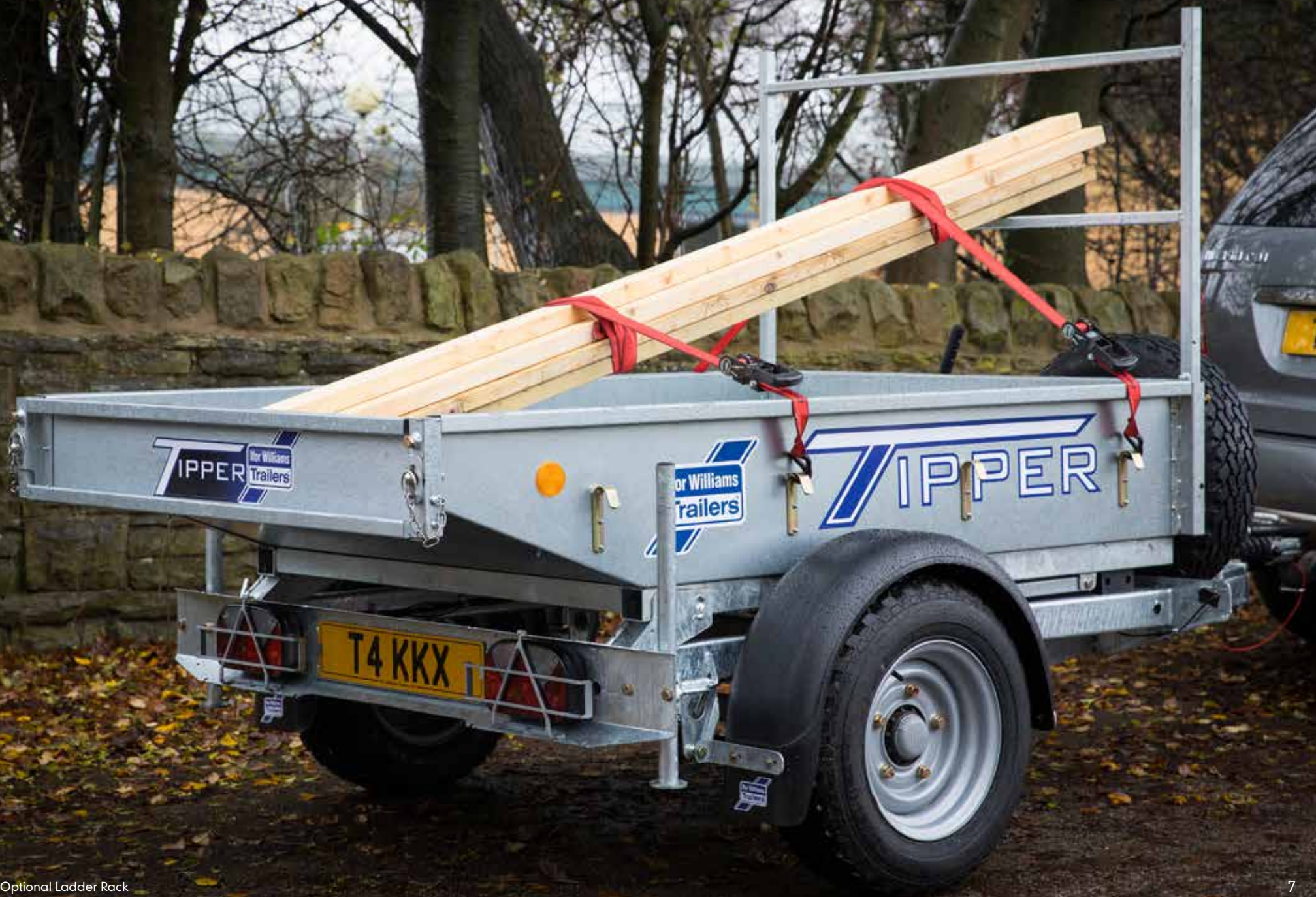
TT2012 With Optional Ladder Rack