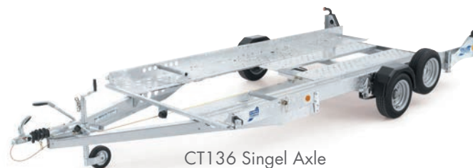
CT136 Singel Axle