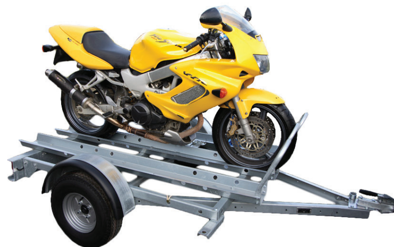
Triple Runner 500kg