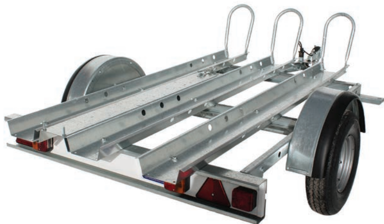
Triple Runner 500kg