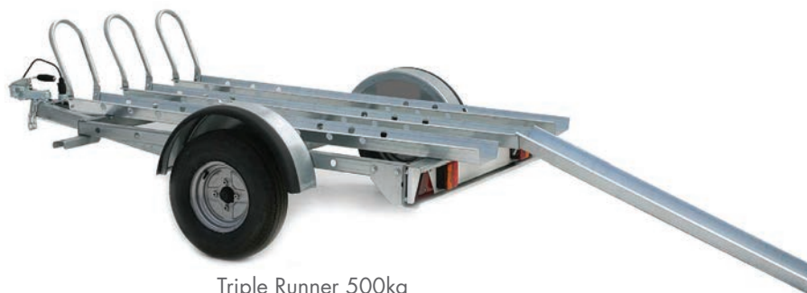
Triple Runner 500kg