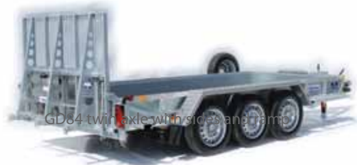
GP146 twin axle with sides and ramp