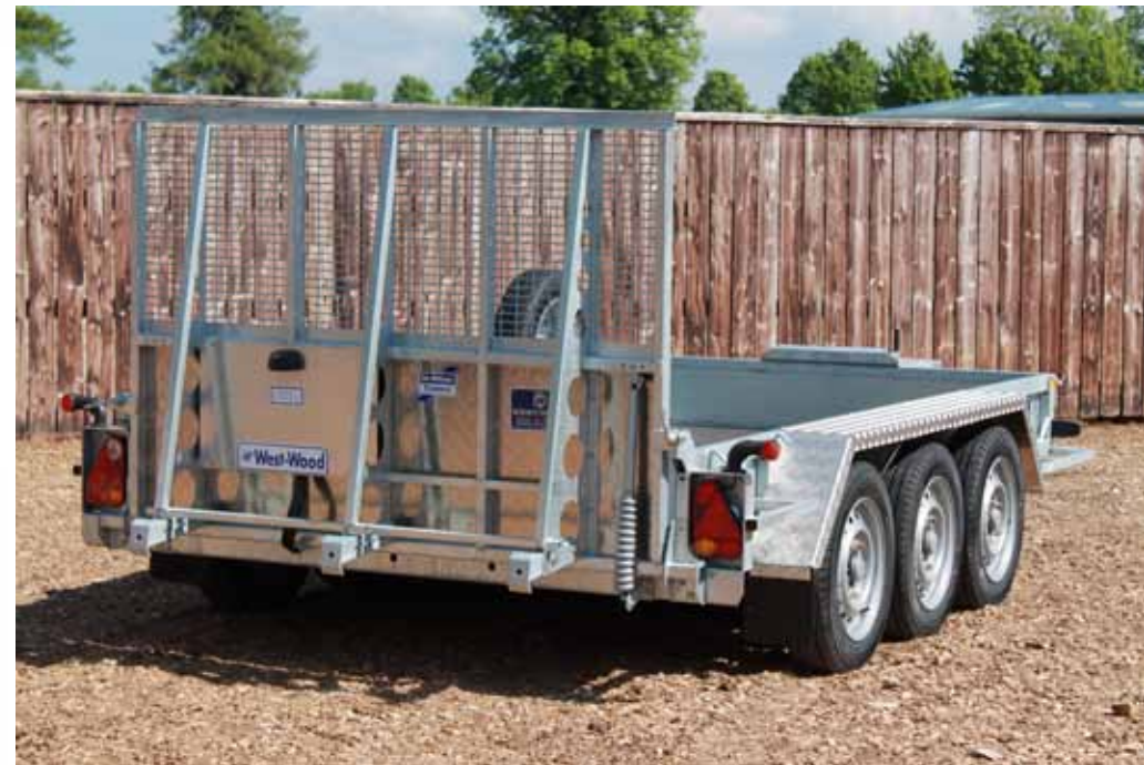
GP126 Tri Axle 175 x 16 wheel