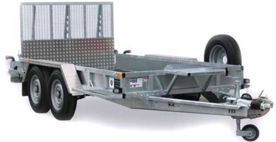
GP126 Plant trailer with 3500 Kg (650 x 1610 ply wheel)