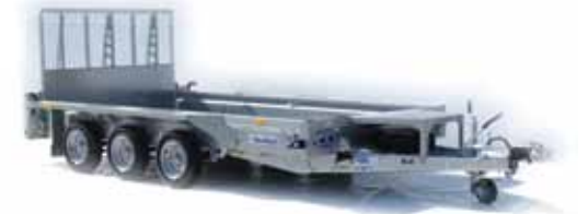
GX126: 12' x 6'1" Tri Axle