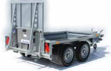
GX84: 8' x 4'