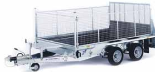
GX106 with Mesh Sides