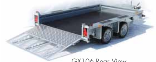
GX106 Rear View