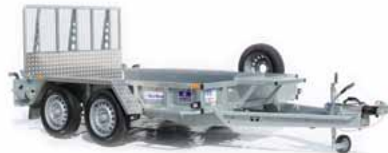
GP106 175 x 16 wheel