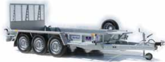
GP126 Tri Axle