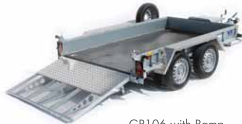
GP106 with Ramp