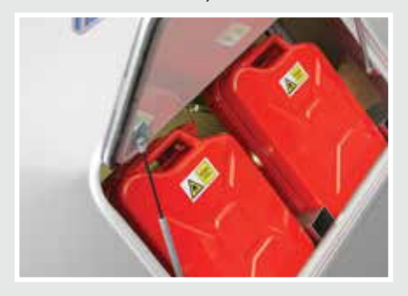
4. Front Wall Access Hatch The front wall access hatch allows for easy access to the front storage cabinet.