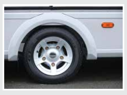
Alloy Wheels Give your trailer the wow factor by adding a set of exclusive alloy wheels.