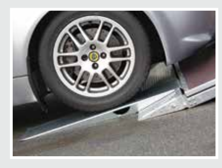
3. Ramp Skid Extenders Pair of ramp skid extenders to aid loading of vehicles with low clearance.