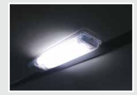
Central front lamp to light up the working area— Powered by towing vehicle or on board battery.